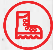
Uniforms / Boot Reimbursement