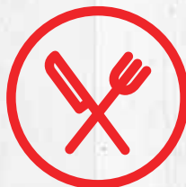
Customer Dining Program