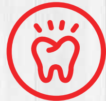
Voluntary Dental, Vision and Life Insurance