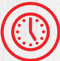
Comp Time Program