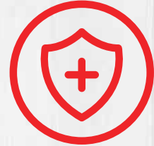
Life Insurance / Long-Term Disability