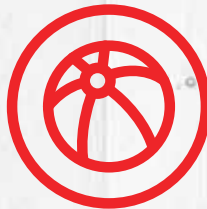
Paid Holidays / Vacations / Personal Time