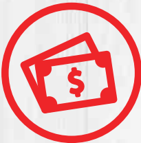
5K It Pays to Perform